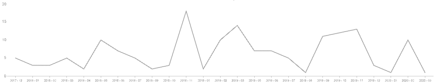
Claim Received for Bulgaria